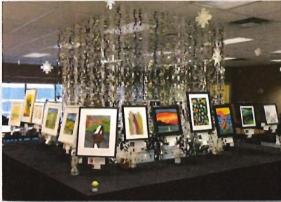
Gallery view from the entrance.